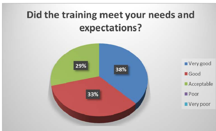
Figure 6: Matching of training expectations with individual needs

Overall the training content has obviously matched the expectations in a very good way, as it is also recognizable in Figure 5, showing the answers to the corresponding question. In total, 71% (17 of 24 persons who answered this item) have agreed to both positive scale values, while 29% (7 persons) rated at least an “acceptable” matching. Thus no participant of the training was disappointed or missed some content. This is underpinned by the fact that the negative categories have not been chosen.