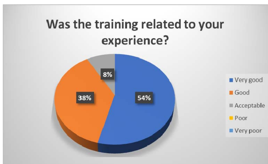
Figure 4: Relation of the training to the experience of the participants

The first considered question related to the action-oriented approach and the implementation of WLA concepts and is shown in Figure 3. The results reveal the success and the highly rated acceptance of the connection between the training and the (work) experience of the participants. In total 92% of the answers (22 out of 24 persons) are rating the training within the positive part of the scale, while the remaining two persons chose an average value. The positive results for this item are indicating a highly matched correlation between the WLA idea of taking the (work) experience of the participants into account as well as the participants' awareness of the how far real work experiences were part of the training, the discussions and the exchange of knowledge.