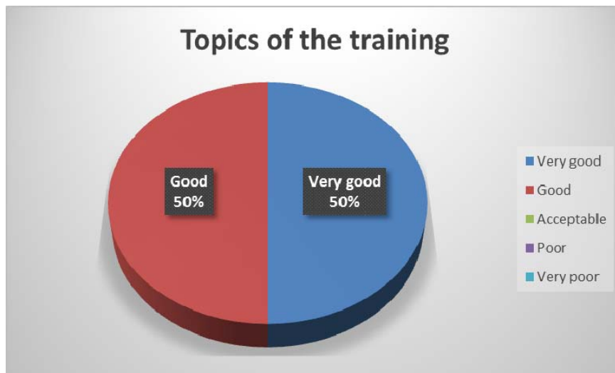
Figure 5: Evaluation of the training topics in general

Overall the training content has obviously matched the expectations in a very good way, as it is also recognizable in Figure 5, showing the answers to the corresponding question. In total, 71% (17 of 24 persons who answered this item) have agreed to both positive scale values, while 29% (7 persons) rated at least an “acceptable” matching. Thus no participant of the training was disappointed or missed some content. This is underpinned by the fact that the negative categories have not been chosen.