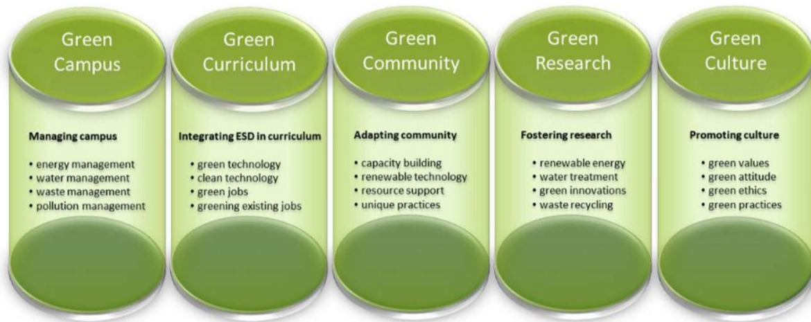
Figure 1: Five Dimensions of Greening TVET (Majumdar 2019)