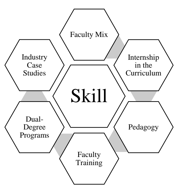
Figure 1: Alternative Way of Generating Skill in the University Model

on the 'rigor' of the design and implementation of modified process points. The interventions in the education delivery process can be done in various ways like choosing an optimal mix of faculties from academia and industries, including an industry internship program in the curriculum, following a facilitator-participants and activity based pedagogy, providing training to the faculties in the Industry, offering dual-degree programs, students being part of industry sponsored problem solving competition, etc. The alternate arrangements usually made by the university authorities in order to enhance skill presented in Fehler! Verweisquelle konnte nicht gefunden werden. below.